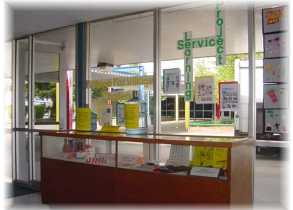
Students are challenged to carry water.