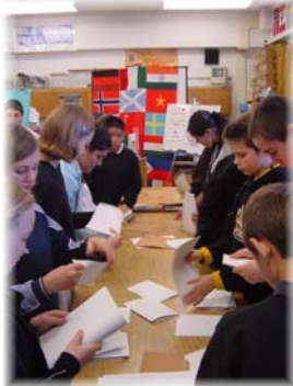
Will Rogers Press Corps at work!