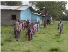
Students line up for lessons.