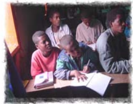
Sunlight is the light by which Kersa students learn their lessons at school.