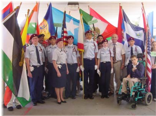
Del Campo High School ROTC Honor Guard Posted Colors for the Assembly of Nations