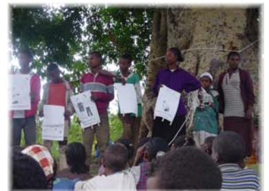
Students learn about how one boy, Abu used the 8 Be's in the book, The Village That Smiled ©, and felt happiness as he made a difference in his village.

The Ellison die cut machine will give students their own micro-enterprise and a way to raise money for their school. Now HOPE can be spelled out in every classroom and in every hut. HOPE remains a symbol of things not seen but will surely happen for the villagers in Kersa Illala, Ethiopia.