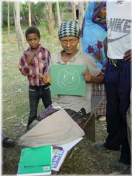
Young girl receives an education kit.