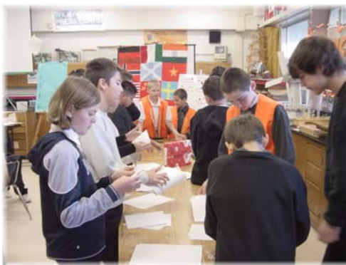
Service learning projects and building booklets