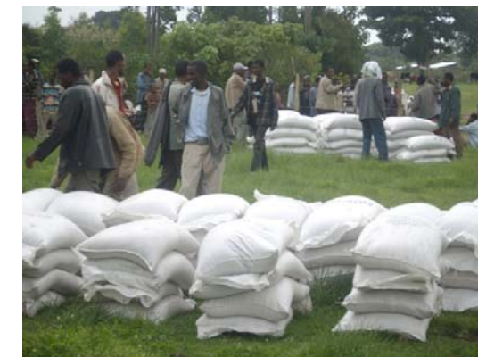
Truckloads of wheat and corn arrive in the village.