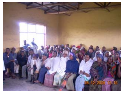
Fathers and Mothers attend class learning about compost preparation.

Educational classes have been very popular and are well attended.