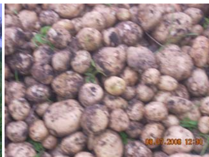
Youth help bring in their first harvest on land they rented in April. The funds from the sale of the crops will help pay the costs of the youth program and will be used to establish a college scholarship fund.